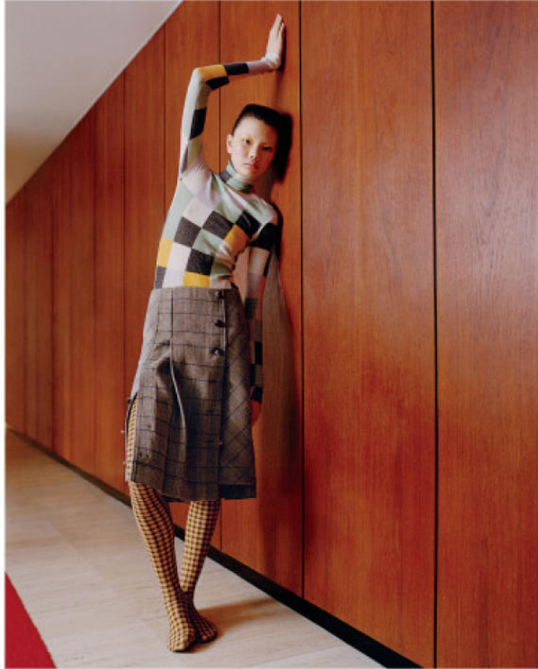
Arthur Anderson sartorial, price on request. Chino shirt, $1,995, chloé.com Bathugga